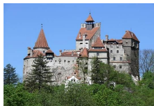
From top: Mosorel Guesthouse, Magura., Brown Bear, Castle Bran.